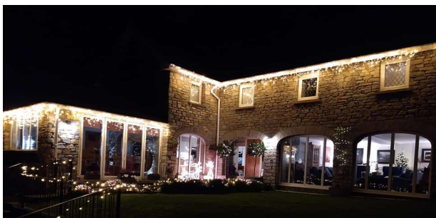
The Nest decked out in its festive glory.